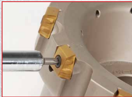
Short bit for "on-edge" product.