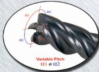
47C...RQ Variable Pitch