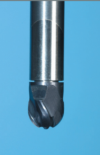
Figure 1b. .010" gap