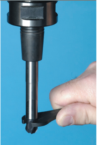
Figure 2. 1/4 turn