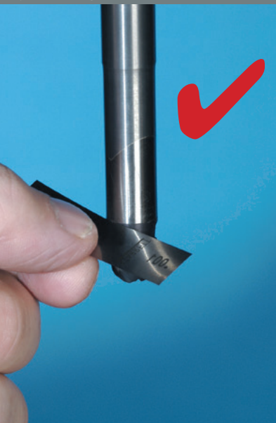
Figure 3b. Proper fit