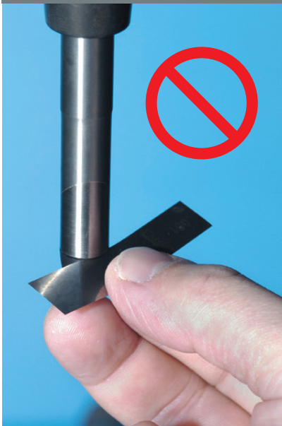
Figure 3a. Shim should NOT enter intersection