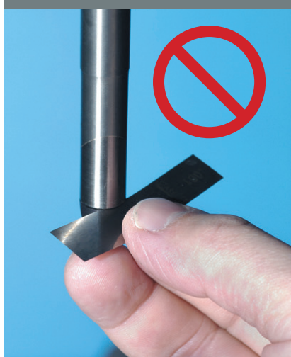
Figure 3a. Shim should NOT enter intersection