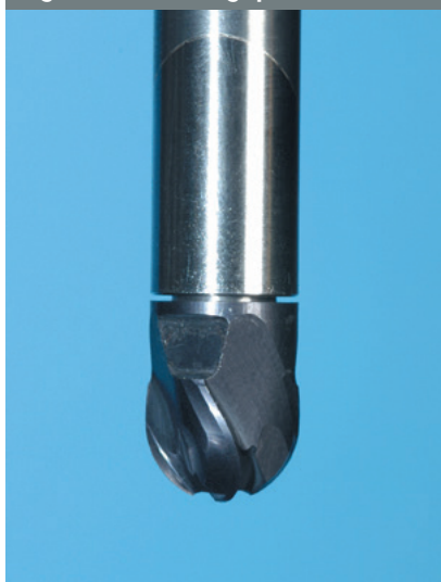
Figure 1b. .010" gap