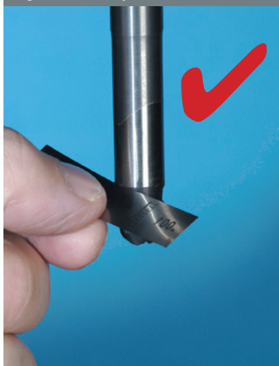
Figure 3b. Proper fit