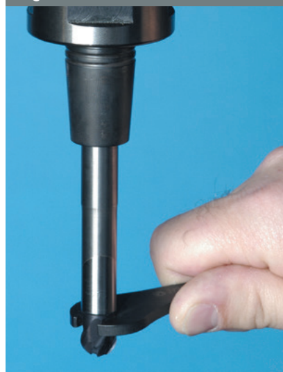
Figure 2. 1/4 turn