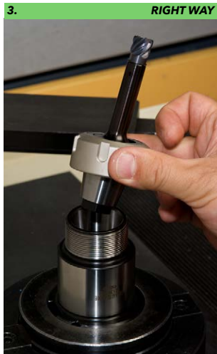
3. Place the nut/shank assembly into the holder and secure the nut.