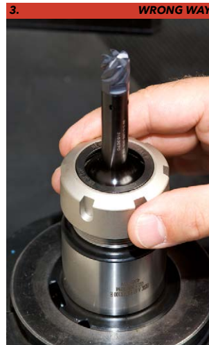
3. Screw the nut on the holder.