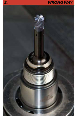
2. Place the integral ER collet into the collet chuck.