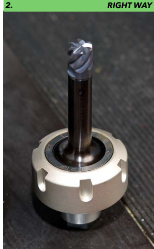
2. The nut/shank assembly is shown ready for installation.