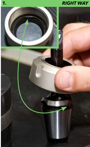
1. Place the nut on the integral ER collet. Assemble the nut with the shank by mating the retention tabs with the ER groove.