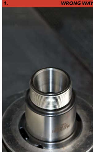
1. Remove nut from ER holder.